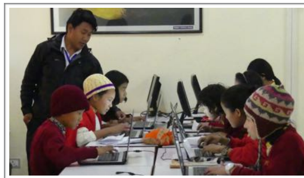
SMD students in computer class.