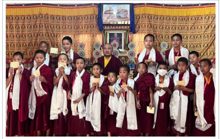
New monks receive refuge names from Chöje Lama Wangchuk. Hover for video.